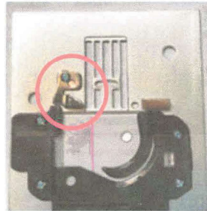
New version from 2022-07